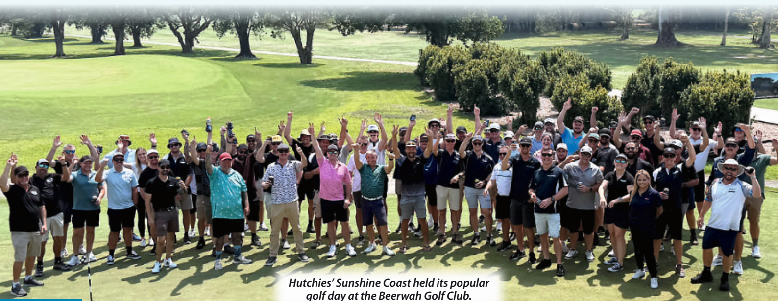
Hutchies' Sunshine Coast held its popular golf day at the Beerwah Golf Club.

The Sunny Coast has also launched its own Instagram page to help raise the profile of its regional office – showcasing what projects the local team has done, posting new jobs, outlining its community involvement, and reaching out to more local companies for pricing.