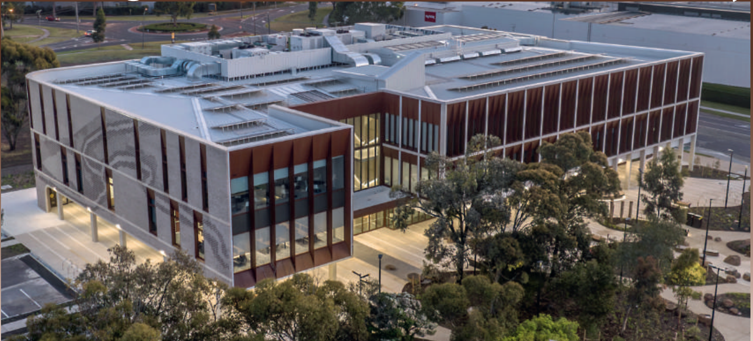
The Hutchies-built Kangan Institute's Health and Community Centre of Excellence in Broadmeadows has scored a 5-Star Green Star rating.

THE Hutchies-built Kangan Institute's Health and Community Centre of Excellence in Broadmeadows is officially now one of Victoria's most sustainable new training facilities, after achieving a 5-Star Green Star rating from the Green Building Council of Australia (GBCA).