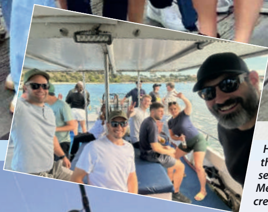
Hijinks on the high seas for the Melbourne crew.

The sun was shining, the beers were flowing, and the fish were clearly biting — a perfect combo for an all-around cracking day out. This one was voted a huge hit and has officially earned its spot in the social club rotation.