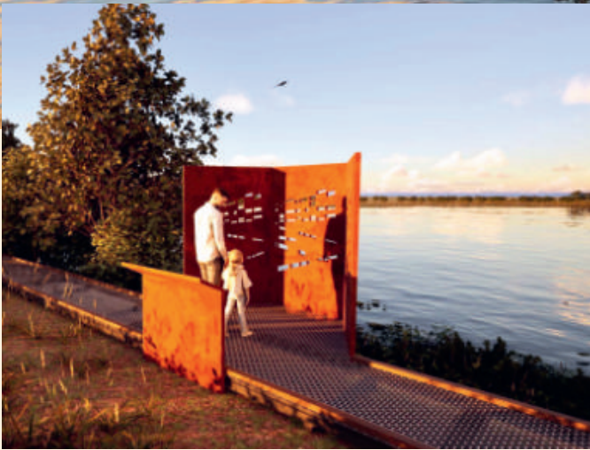
LEFT & ABOVE: Hutchies' public bird hide, boardwalk, and walking trail will give tourists better access to Cumberland Dam's extensive population of native and migratory birdlife.