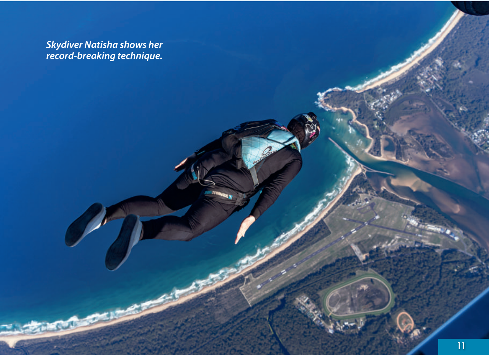
Skydiver Natisha shows her record-breaking technique.

skydivers, wearing aerodynamic suits, intentionally orient themselves head-down to achieve maximum vertical speed before deploying their parachute.