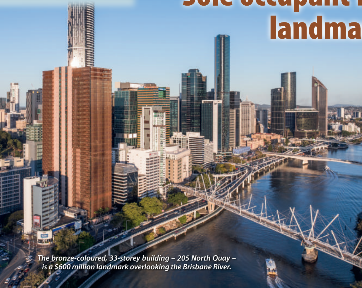
The bronze-coloured, 33-storey building – 205 North Quay – is a $600 million landmark overlooking the Brisbane River.

IN partnership with national integrated property investor and developer, Cbus Property, Hutchies has delivered 205 North Quay – a $600 million landmark now complete and setting a new national benchmark for wellness-led workplace design.