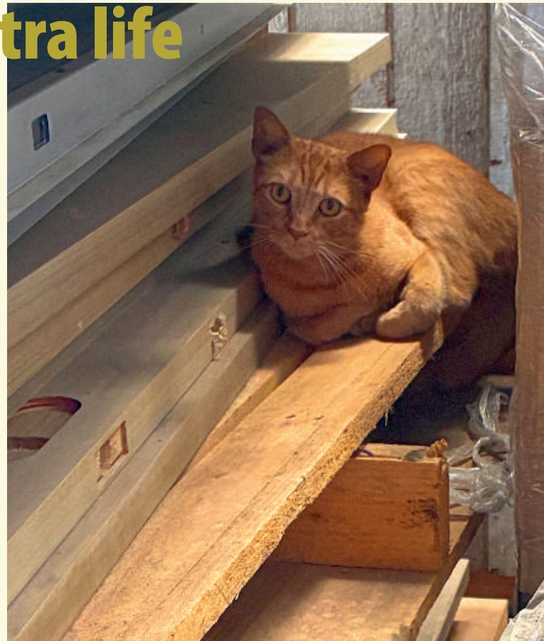
This stray cat was found hiding out in the old training shed at Hutchies' Yatala yard.

It turned out that Charlie may have used up most of his nine lives as he travelled more than 10 kilometres from the family home – crossing the busy M1 motorway and making his way along some of the area's busiest industrial roads before eventually taking up