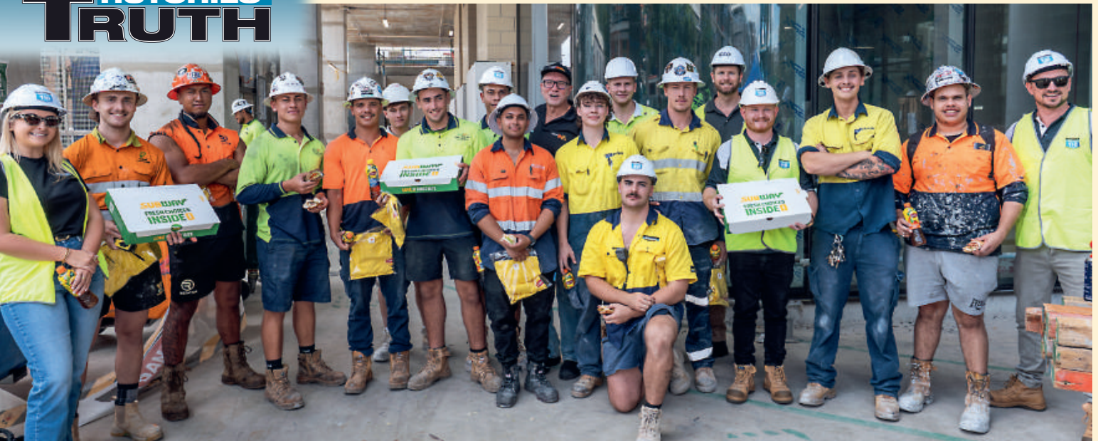
National Apprenticeship Week Australia was celebrated on Hutchies' 50 Quay Street project.