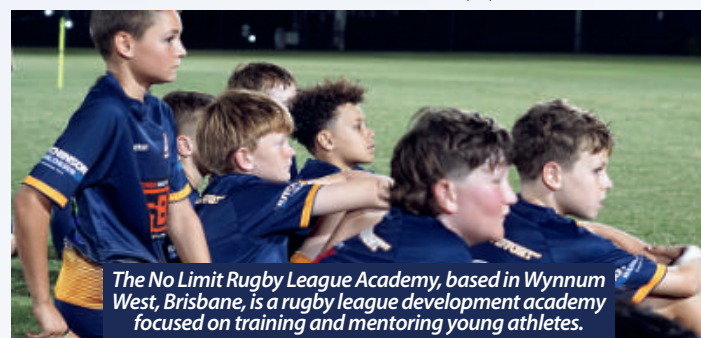
The No Limit Rugby League Academy, based in Wynnum West, Brisbane, is a rugby league development academy focused on training and mentoring young athletes.

Their attitude towards the job, their professionalism, friendliness, and commitment have built some