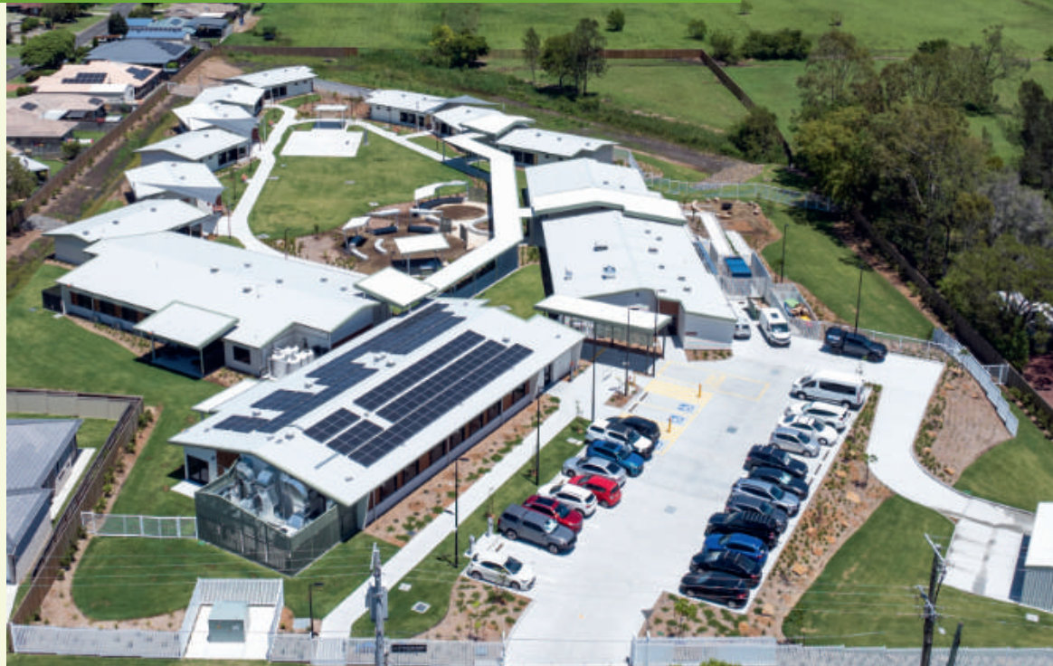
Ipswich residential rehabilitation facility has a calm and inclusive environment.

These features, combined with modern amenities, promote holistic care and help individuals feel