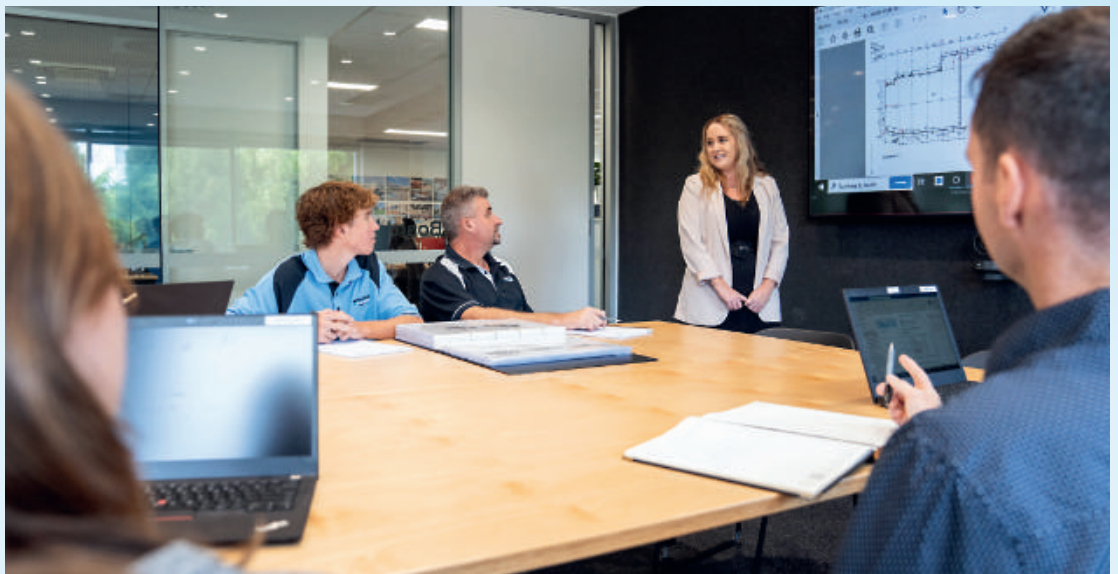
Video conferencing has become a valuable collaborative tool connecting teams across the national network.

Scott said video conferencing had become a valuable collaborative tool.