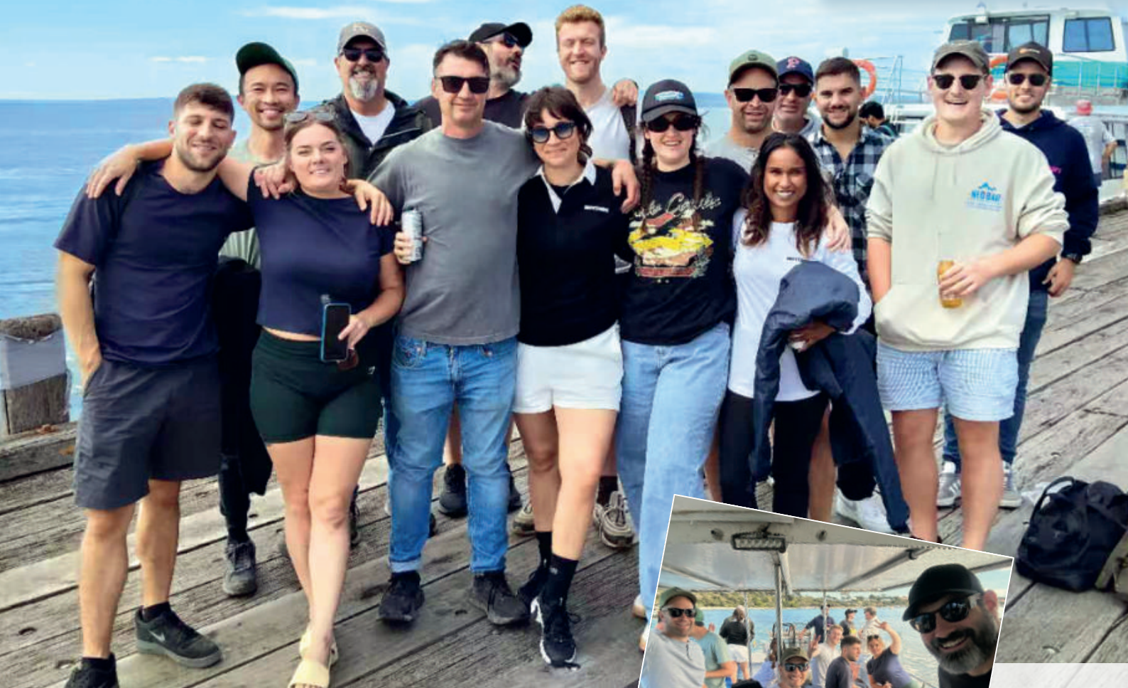
Melbourne team members ready for their fishing day out on the water.

MELBOURNE'S social club set sail in March for a legendary fishing adventure and, for once, the fish didn't stand a chance.