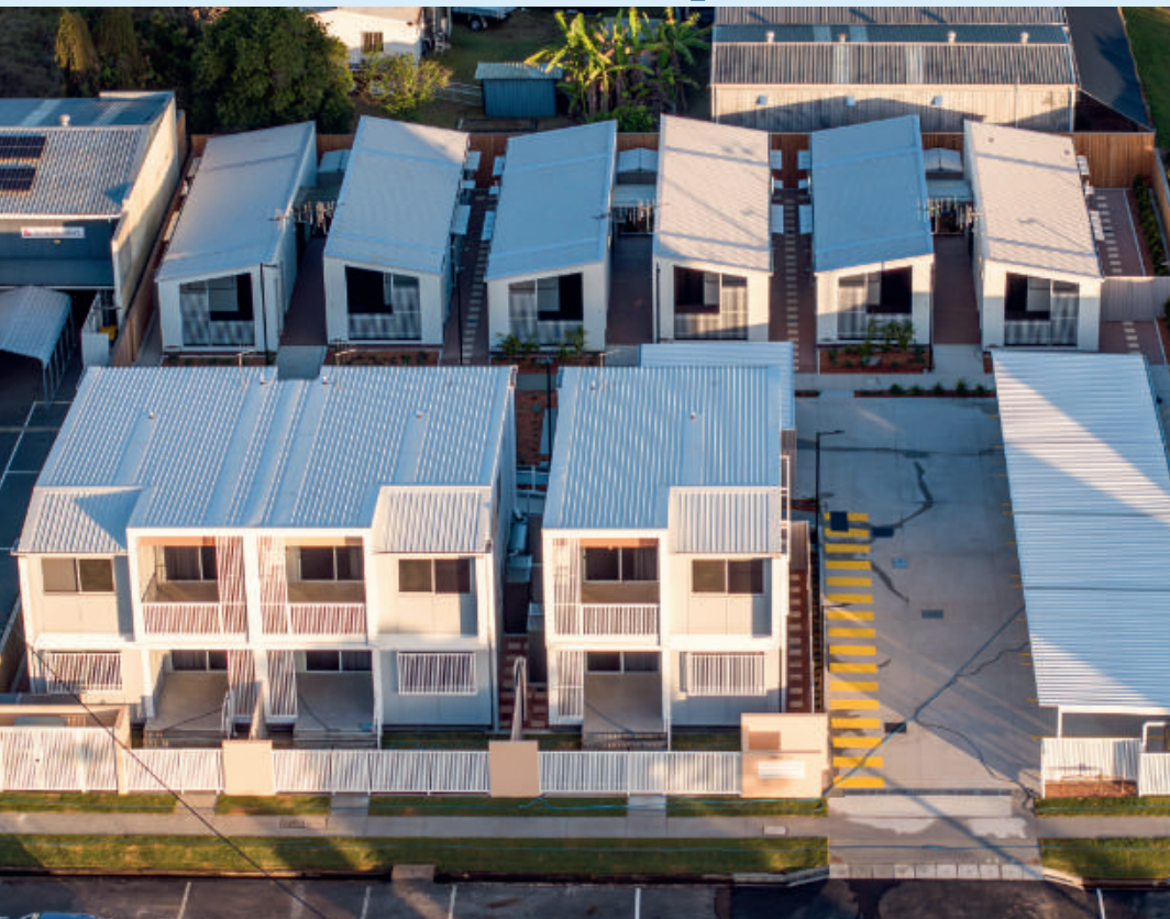
New low-rise residential development by Hutchies in Bundaberg East.

HUTCHIES has delivered a new low-rise residential development in Bundaberg East on behalf of the Queensland Department of Housing and Public Works, QBuild.