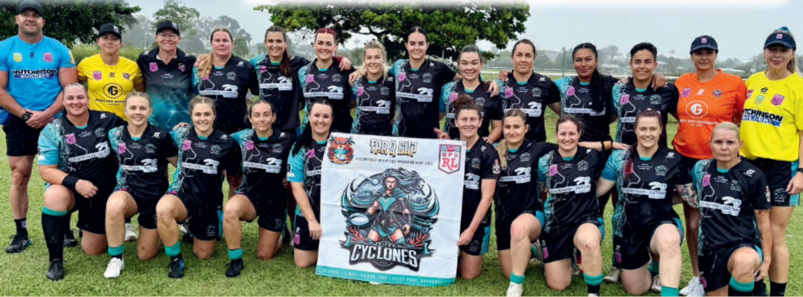
Hutchies is an OG sponsor of the City Cyclones QPS Women's RL team.

HUTCHIES is an OG sponsor of the City Cyclones – the Queensland Police Service (QPS) Women's Rugby League team based in Brisbane. The Cyclones enjoy friendly rivalry with