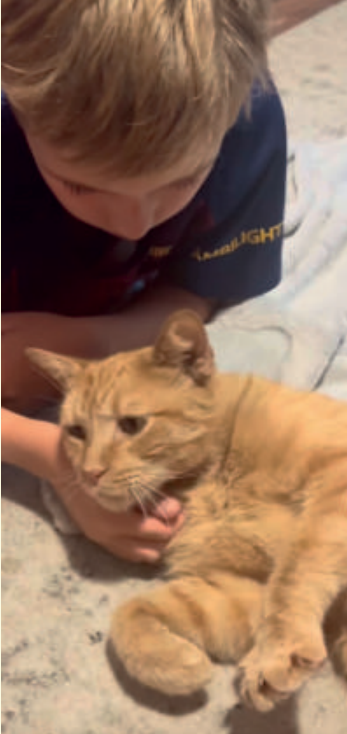
Charlie is enjoying being home with his family after three years.

HUTCHIES' team at the Yatala yard went above and beyond the line of duty when they reunited a young family with its pet cat which had been missing for three years.