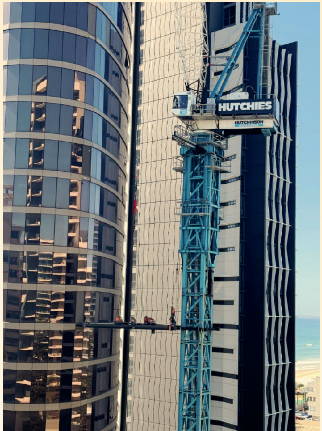
Riggers working to dismantle the crane on Royale Gold Coast.