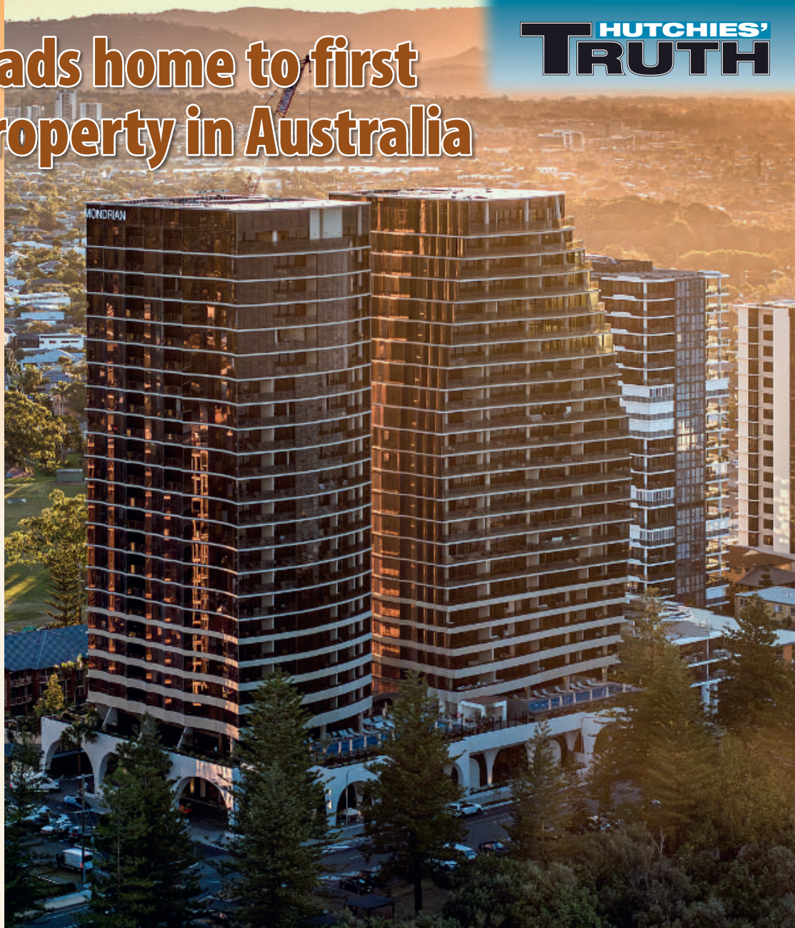
Mondrian residents enjoy a range of hotel services, including surf lessons.

Mondrian Gold Coast demonstrates Hutchies' ability to deliver high-quality mixed-use projects for global brands.