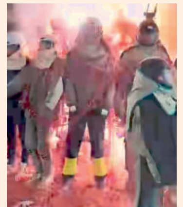
Fireworks engulf the group for about 45 seconds of explosive noise and heat.

As well as the crowd rocket firings, festival-goers can opt to have their bodies wrapped bonfire-style with strings of firecrackers that are then set alight.