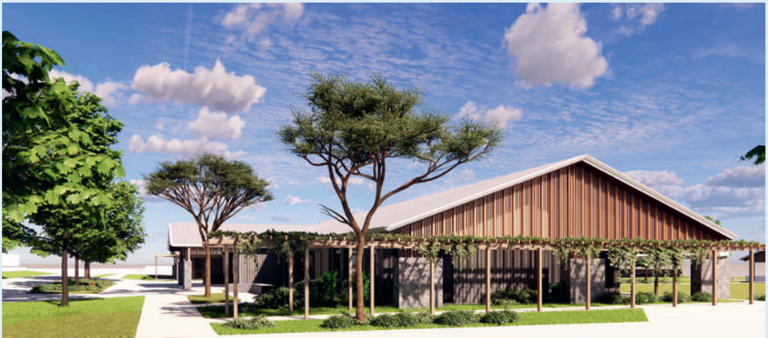
A clubhouse within AVID Property's Vantage Lilywood resort-style development is under construction by Hutchies.