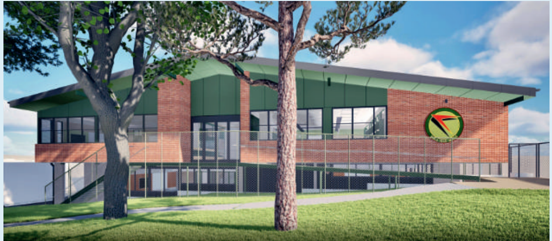
Hutchies is building a new Science, Technology, Engineering and Mathematics (STEM) centre within the Buckley Park College campus in Essendon, Melbourne.