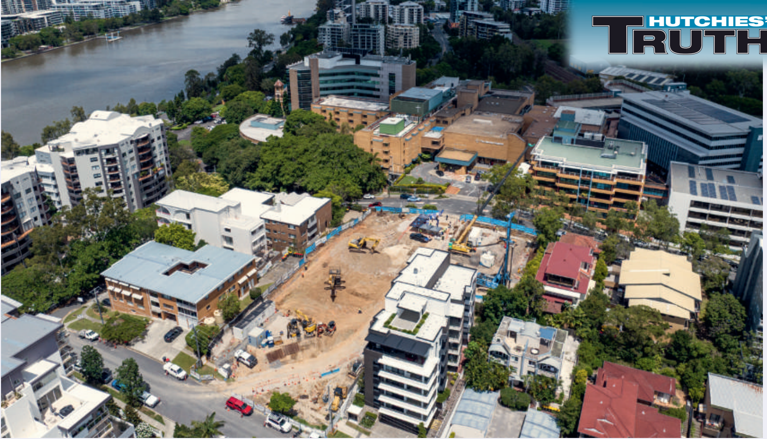
A major expansion of The Wesley Hospital is underway.