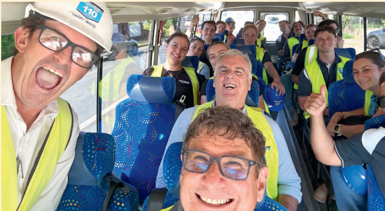
LEFT: Summer school group en route to another construction site aboard Hutchies' van, affectionately known as Shirley.

contract administrators, project managers, estimators, design managers, team leaders, and builders of the future.