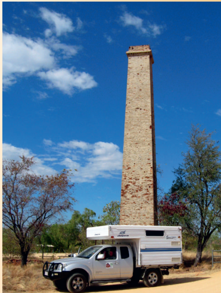
The Cumberland Chimney, built by Cornish stone masons, is a stark reminder of Georgetown's gold rush era of the late 1800s and a popular attraction for tourists.

• For more information, see Jobs Update, Page 18.