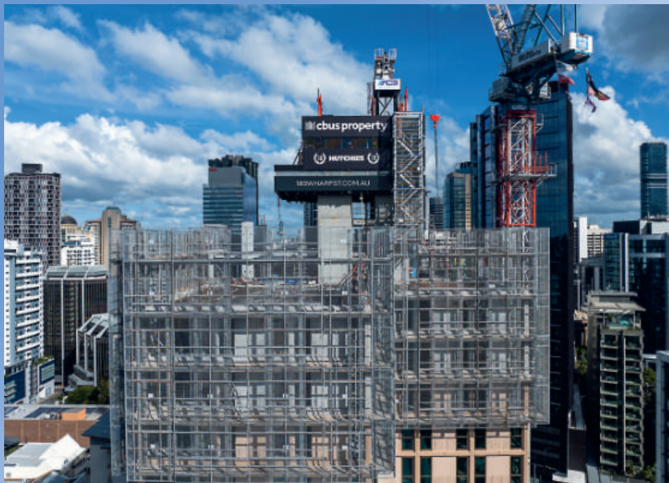
Cbus Property's 185 Wharf Street is on track for completion next year.

CBUS Property's latest venture, 185 Wharf Street, in Brisbane's Spring Hill, is powering ahead and on schedule for completion next year.