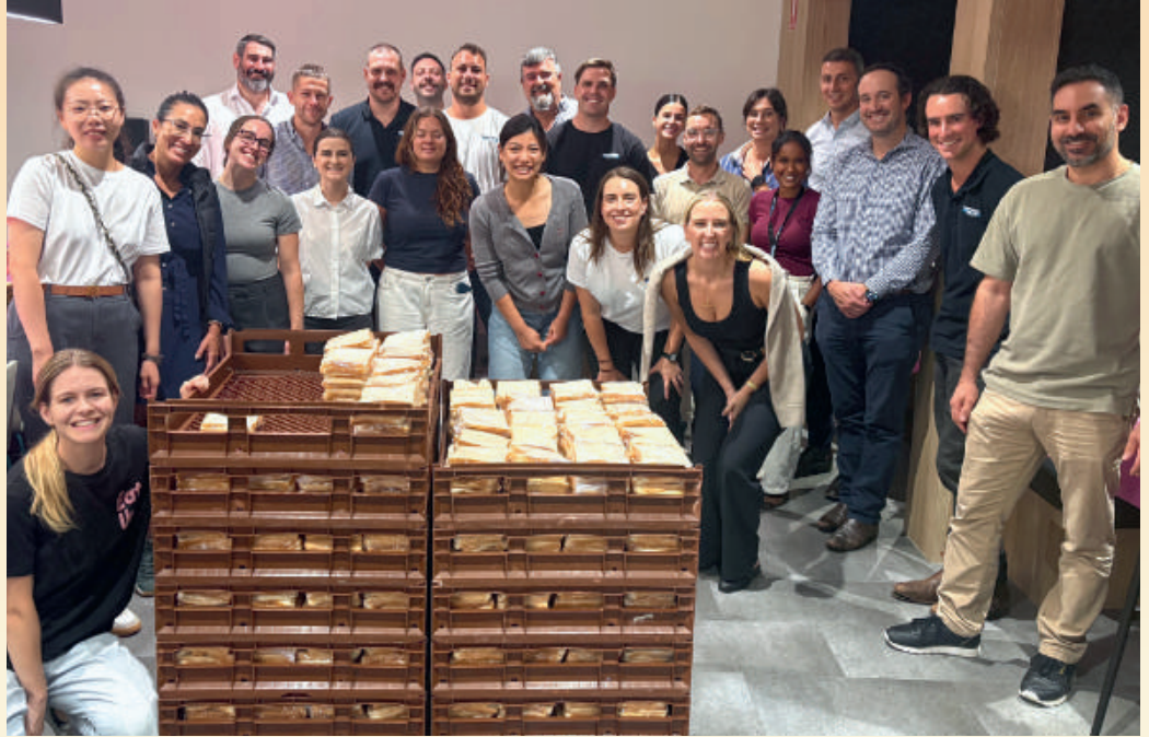
Members of team Doyle display the results of their efforts for Eat Up!

Established in 2014, this impressive not-for-profit organisation now reaches more than 1,100 schools across New South Wales, Northern Territory, Victoria, Queensland and South Australia.