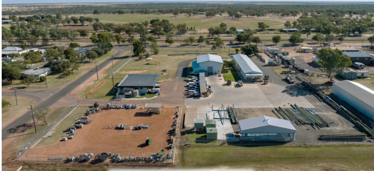
Ergon Energy depot in central Queensland's Barcaldine.

Hutchies is proud to back the energy network that powers the state and to support essential infrastructure in regional and outback Queensland.