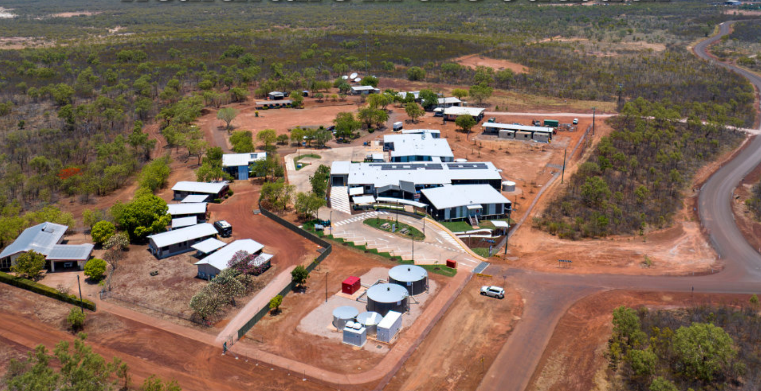
Aerial view of the Normanton Hospital.