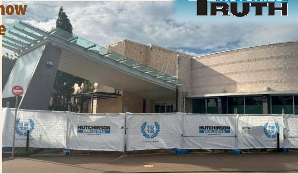
Hutchies has begun work on the flood-damaged Gympie Civic Centre.

"It signals the renewed civic centre will not only be a building upgrade but also a