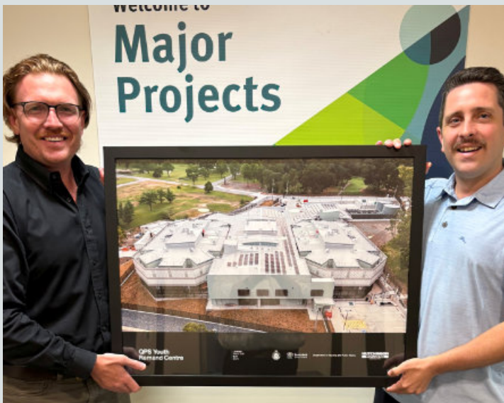
The memento of the successful joint effort project now hangs on the wall of the DHPW offices in Albert Street, Brisbane.