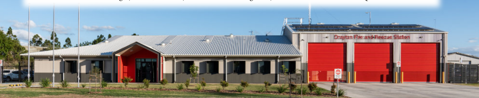
Hutchies has completed work on the new Drayton Fire and Rescue Station.

The project has received glowing feedback from the QFD.