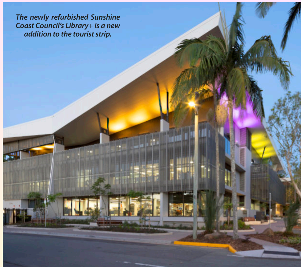
The newly refurbished Sunshine Coast Council's Library+ is a new addition to the tourist strip.