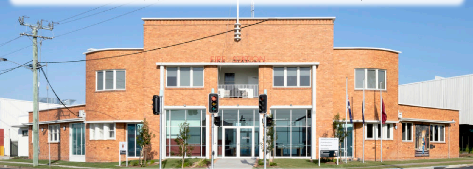
Maryborough Fire Station was delivered by Hutchies with Hyne Timber, XLam, Baber Studio, Bligh Tanner, and the University of Queensland.

The project showcases sustainable design, exposed timber structures, and a carbon-neutral outcome – saving 1,742 tonnes of CO 2 .