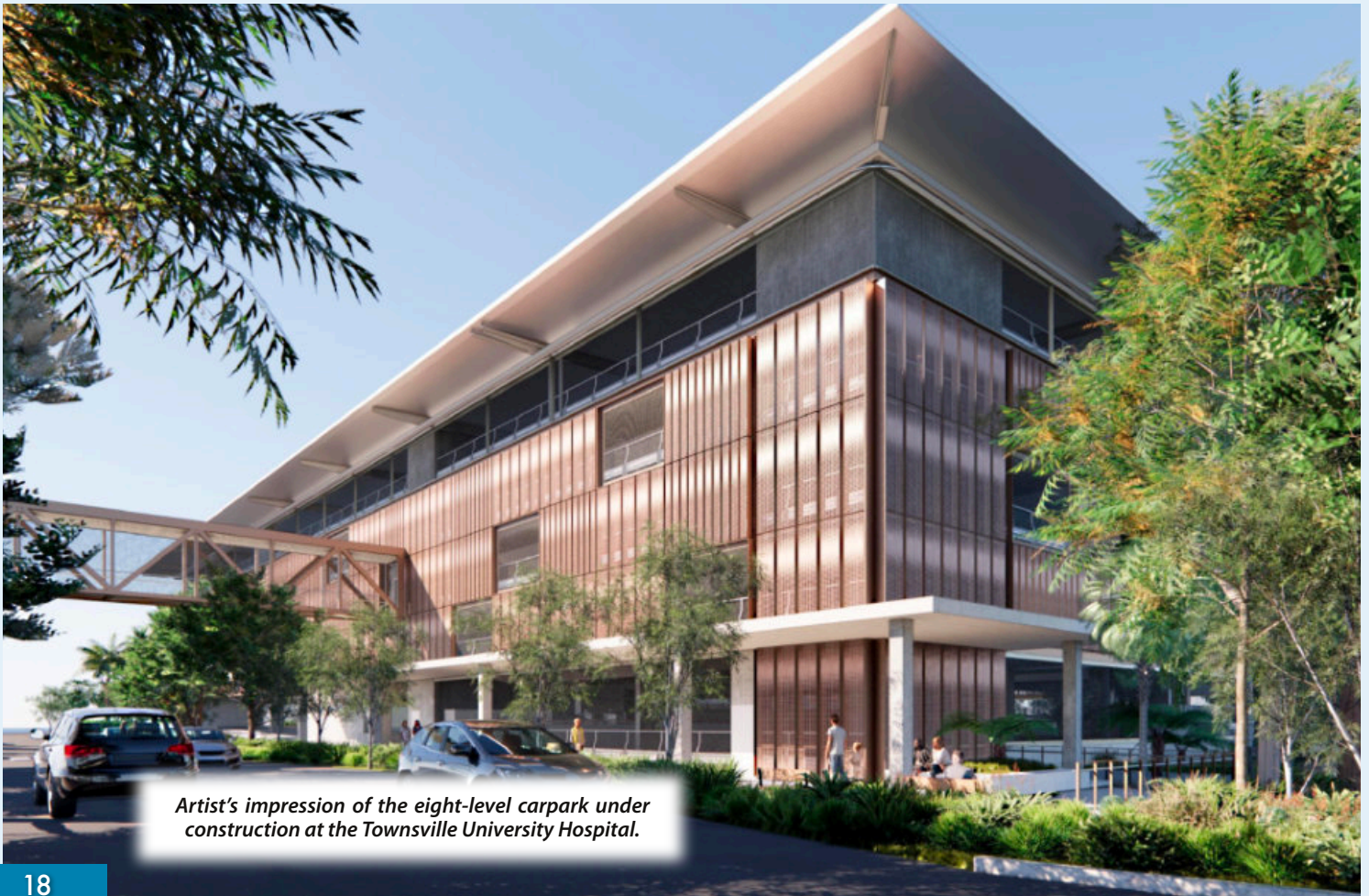
Artist's impression of the eight-level carpark under construction at the Townsville University Hospital.