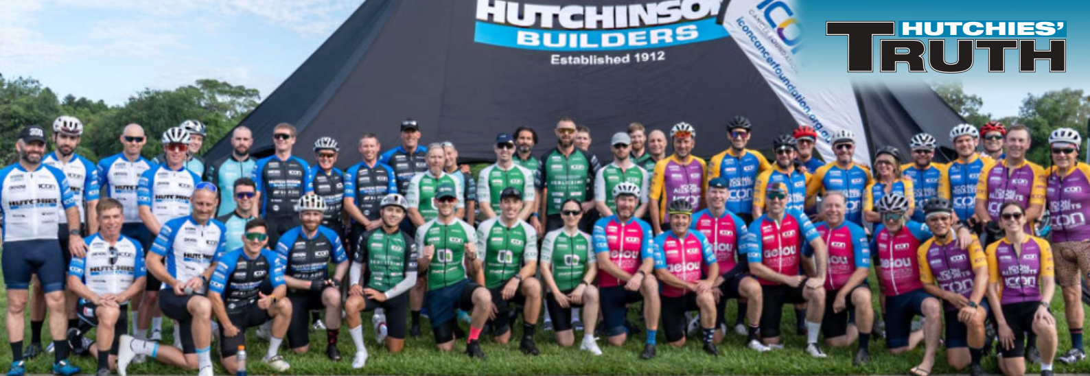
Participants in the 2025 Hutchinson Builders' Challenge Ride.