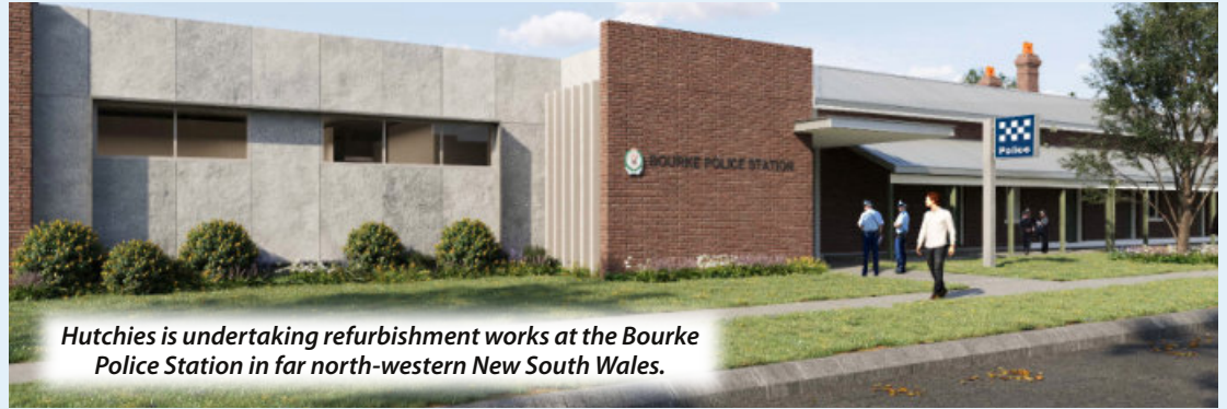
Hutchies is undertaking refurbishment works at the Bourke Police Station in far north-western New South Wales.