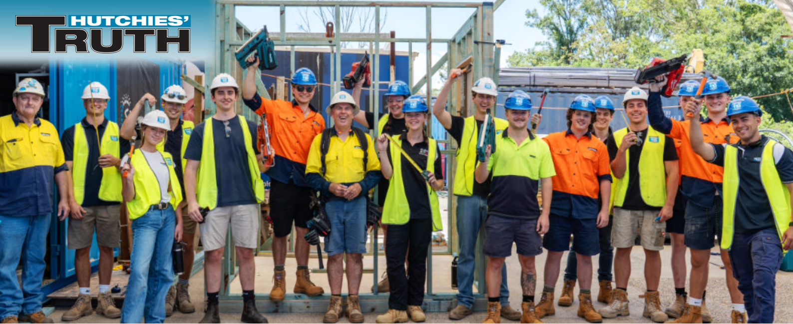
Hutchies' Cadet Summer School cohort for 2025/26.