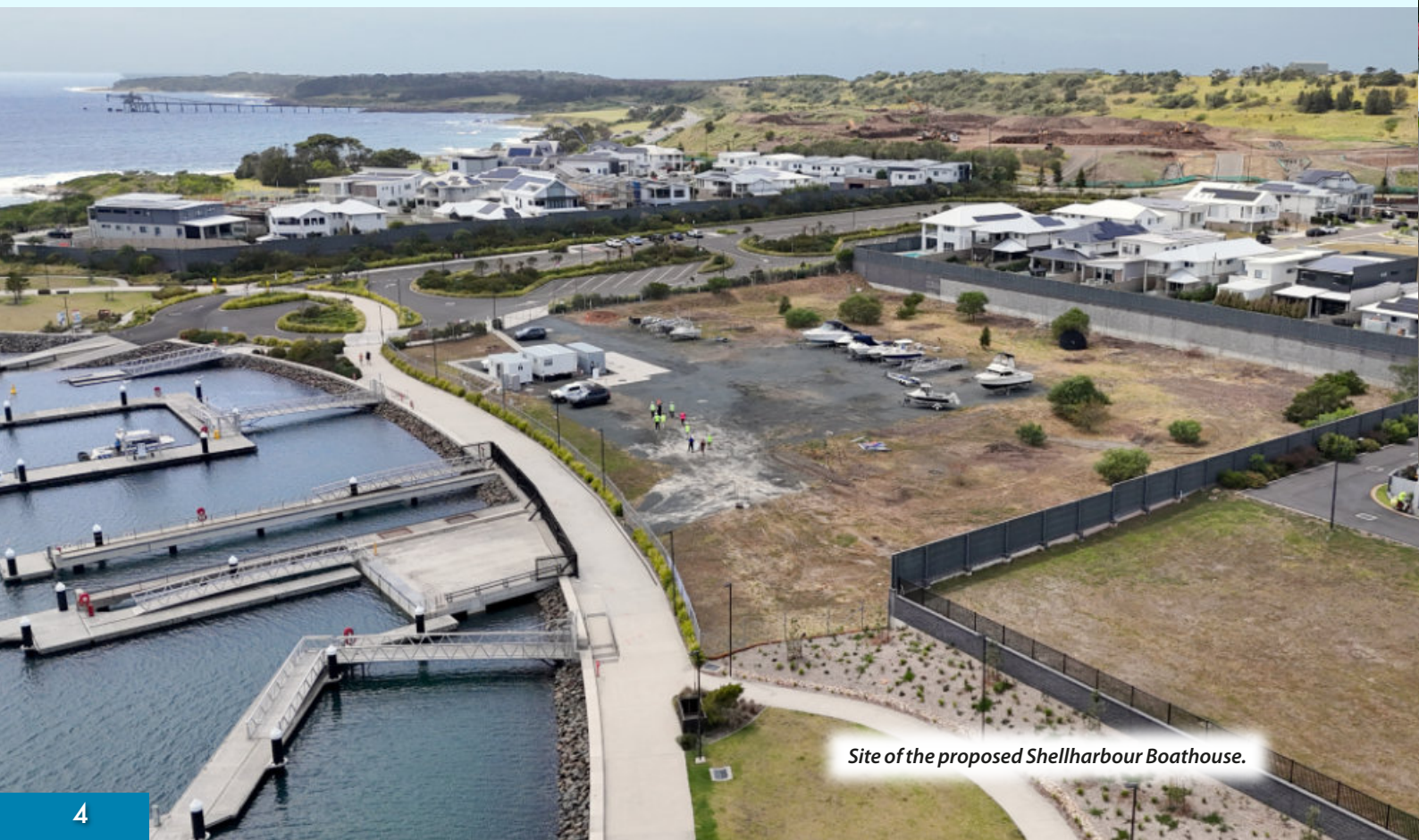
Site of the proposed Shellharbour Boathouse.

The project has been jointly funded by Shellharbour City Council and the NSW government.