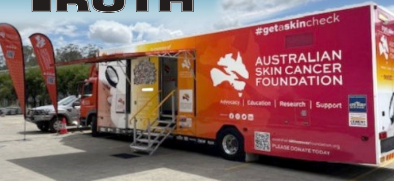
Hutchies is working with the Australian Skin Cancer Foundation to deliver more mobile clinics to Hutchies' sites.