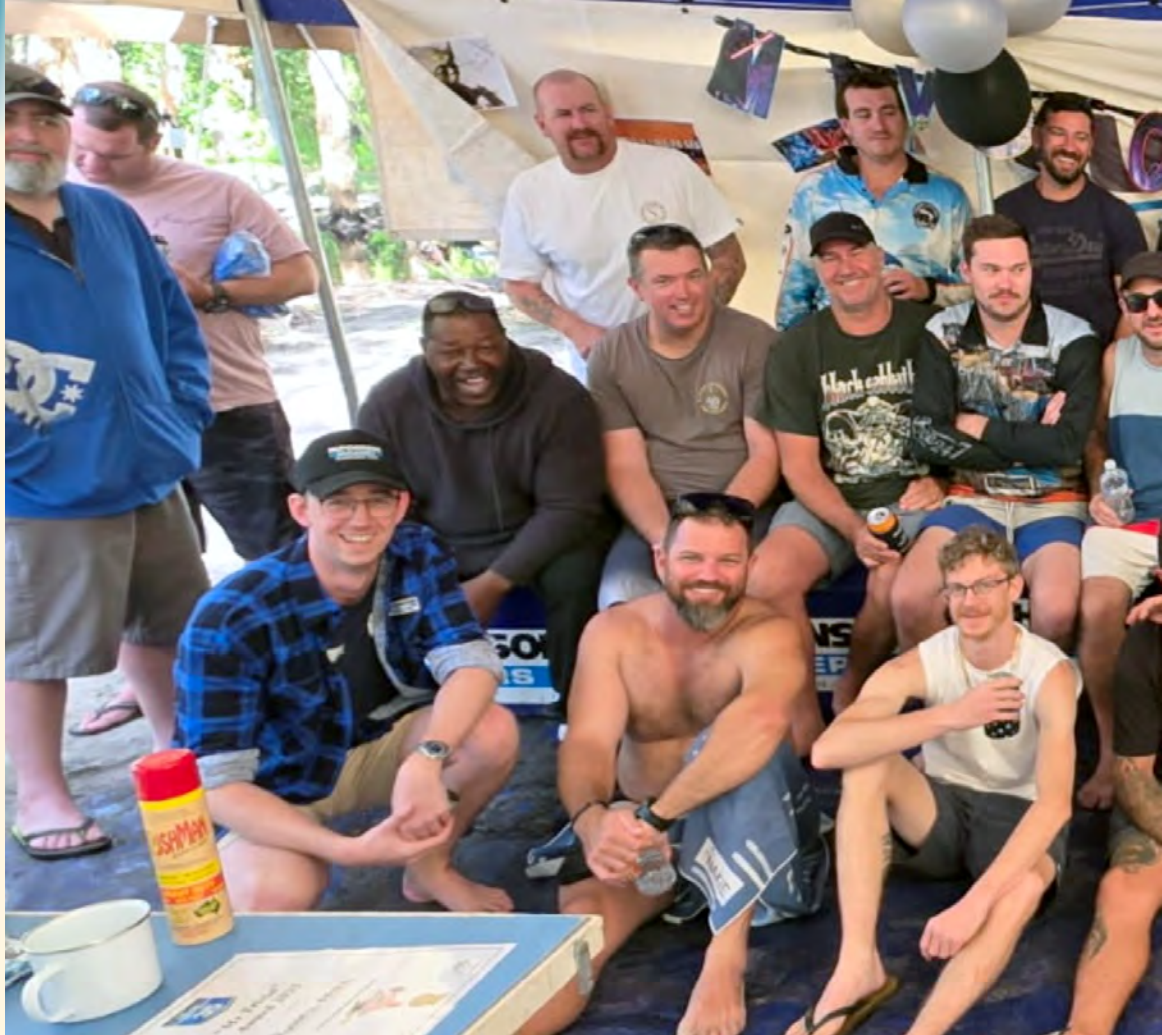
Some of the first timers and event veterans at the record-breaking men's fishing weekend.

Planning is now underway for 2026 to celebrate the annual event's 40th anniversary.