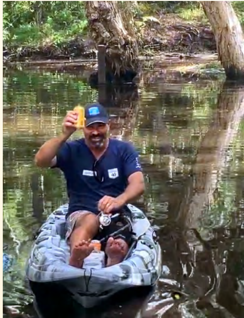
Kayaks came in handy at the waterlogged camping site over the wet we