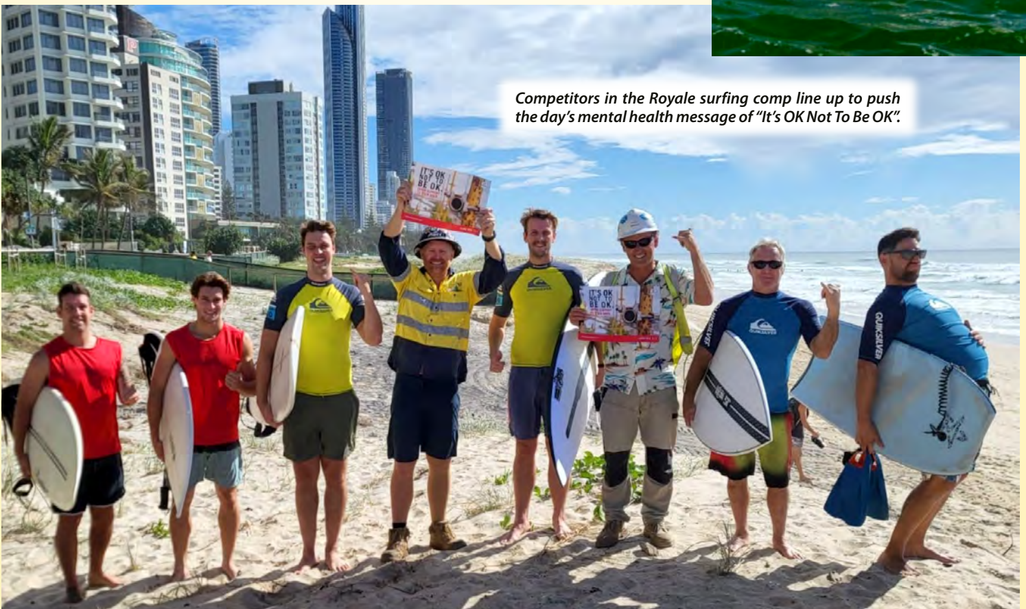
Competitors in the Royale surfing comp line up to push the day's mental health message of "It's OK Not To Be OK".