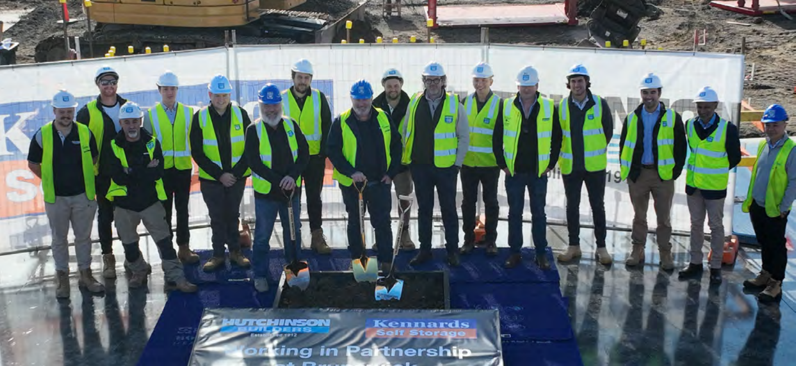
The Kennards Self Storage Brunswick project is expected to be completed by late July 2026.

HUTCHIES and Kennards Self Storage held an official sod-turning ceremony on the Kennards Self Storage project in Brunswick, Melbourne to celebrate the start of construction of a new six-level self-storage facility comprising more than 1600 storage compartments, showroom and amenities.