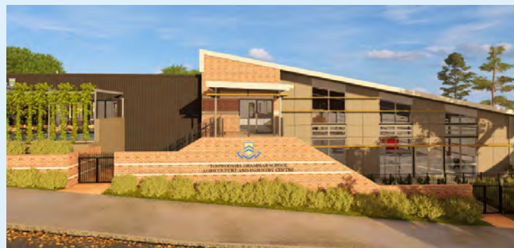
Construction of an agriculture and industry centre building is underway within the Toowoomba Grammar School campus on the Darling Downs.