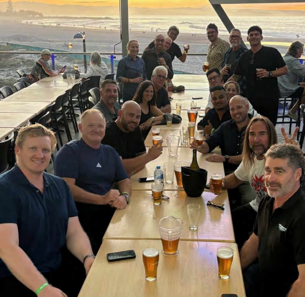
Some attendees of the national health and safety meeting sampled life outside the Cooly office.