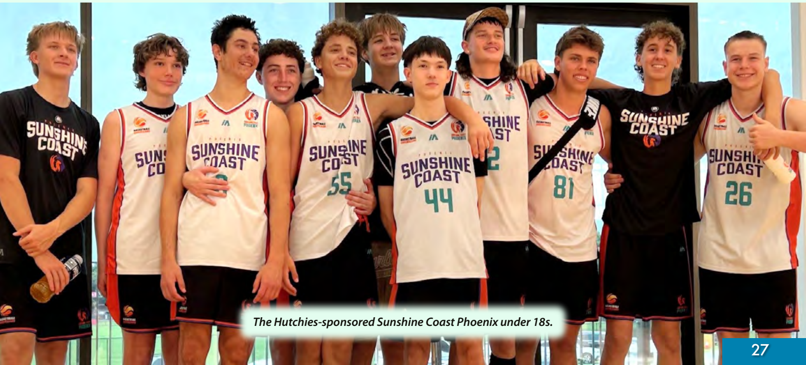
The Hutchies-sponsored Sunshine Coast Phoenix under 18s.