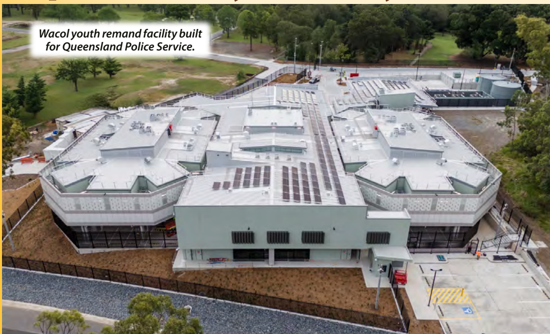
Wacol youth remand facility built for Queensland Police Service.

HUTCHIES has handed over a 76-bed youth remand centre at Wacol, in outer southwest Brisbane, built for Queensland Police Service under a rapid delivery model.