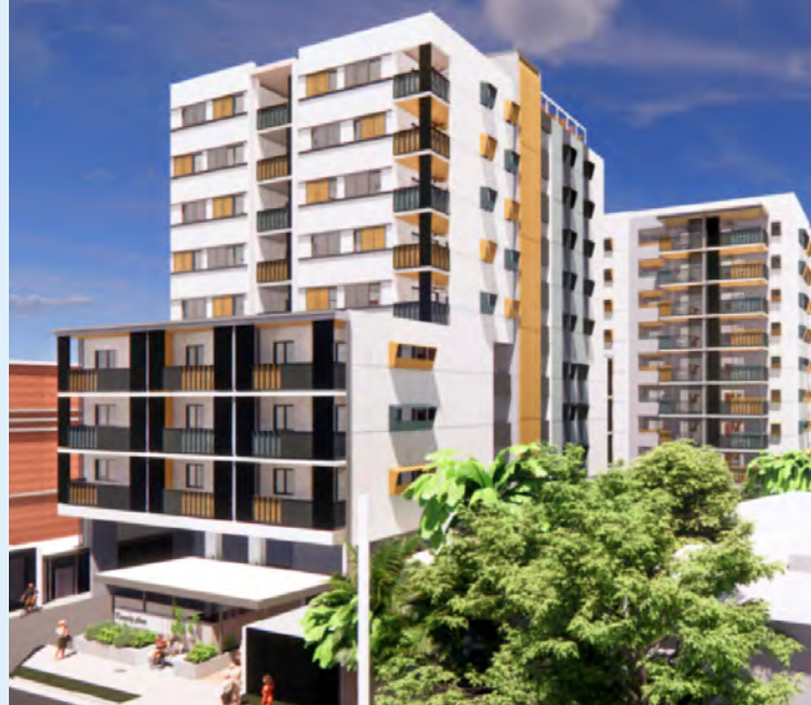
Artist's impression of a dual nine-storey social housing project under construction in East Brisbane.