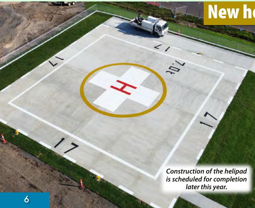
Construction of the helipad is scheduled for completion later this year.

Hutchies has been working closely with the client to ensure minimal disruption to hospital services and for helicopter transfers to continue as normal.