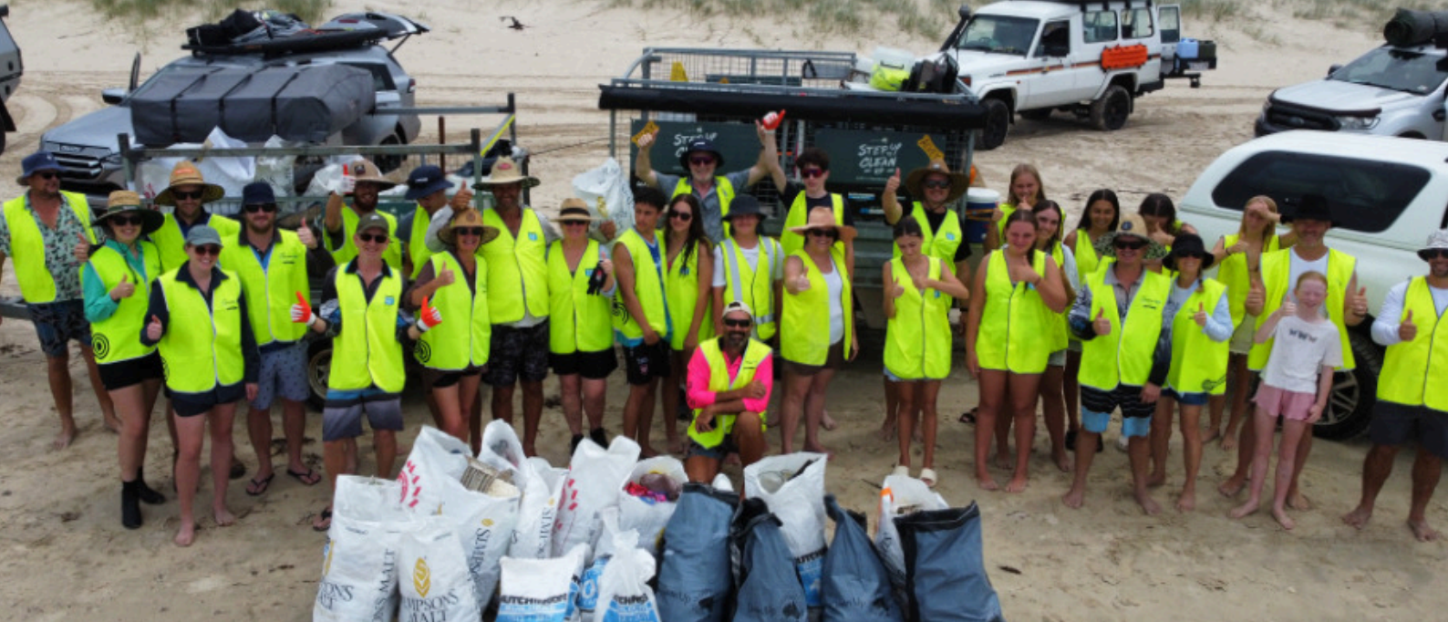
Hutchies' volunteers on Clean Up Australia Day removed more than 257 kilograms of rubbish from the beach in just three hours.

THE world's oceans are a little bit cleaner thanks to Hutchies' regular volunteers to Clean Up Australia Day.