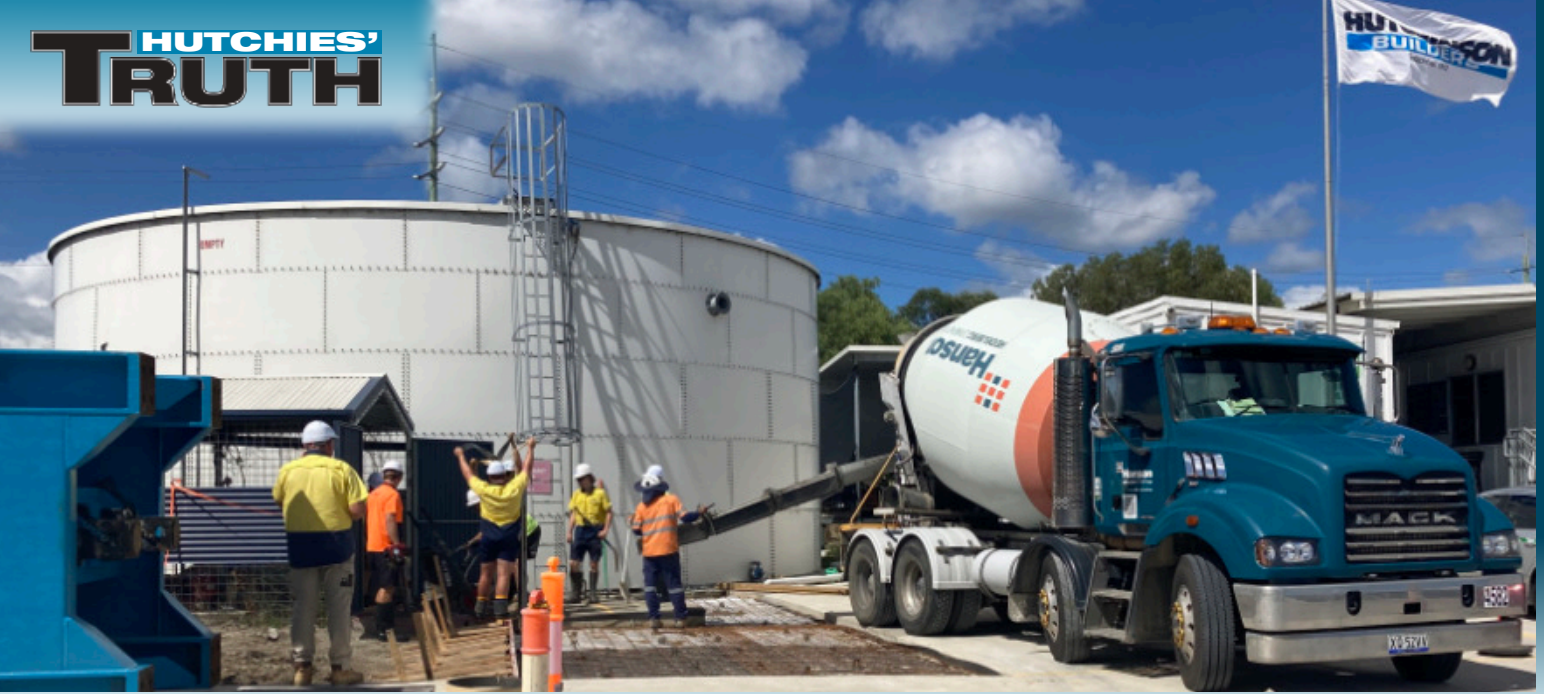
Apprentices learn to work around equipment safely during the concrete class.