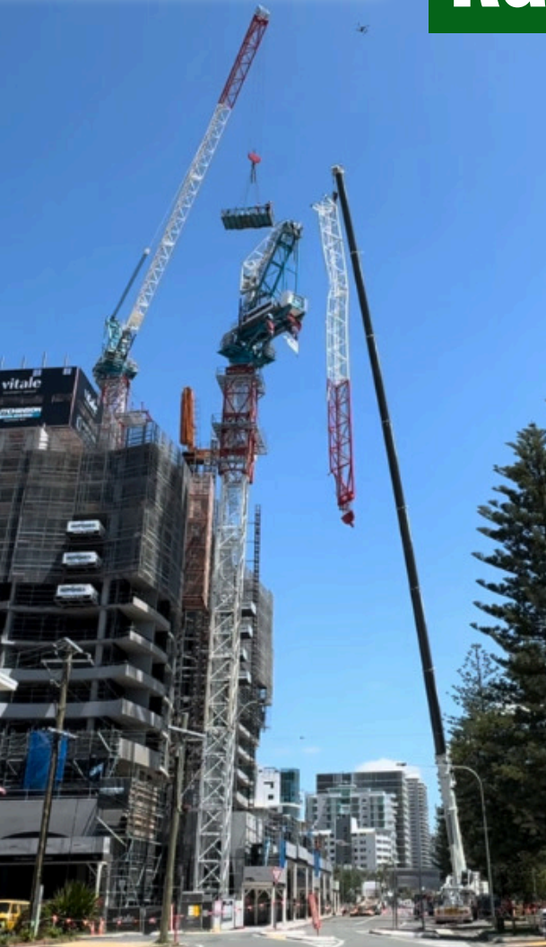
Disassembling the tornado-damaged luffing crane on the Mondrian construction site was a delicate operation.