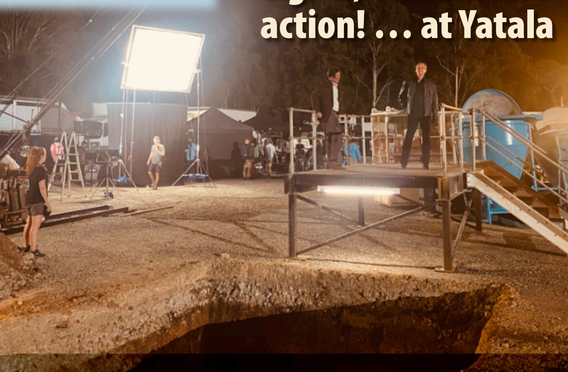
Production team on Boy Swallows Universe.

HUTCHIES' crane yard at Yatala had a starring role in the filming of the gritty Netflix series, Boy Swallows Universe .