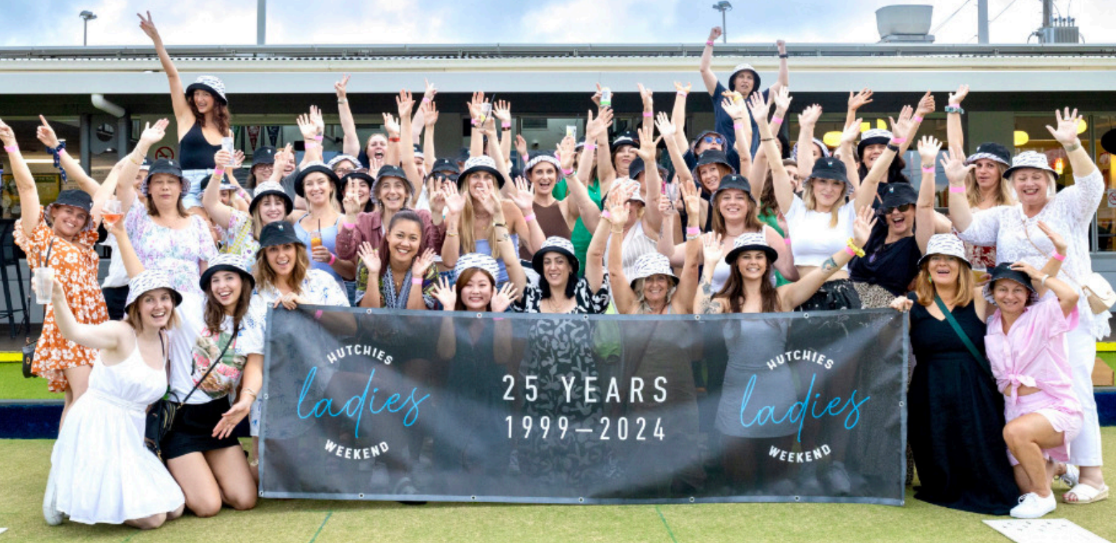
Attendees at the 25th anniversary of the inaugural ladies' weekend which coincided this year with IWD.