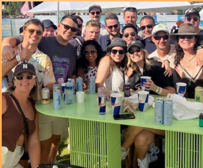
Melbourne turned on a stunning day ensuring a large turn-out of the local team for the popular annual Laneway Festival held at Flemington Racecourse.