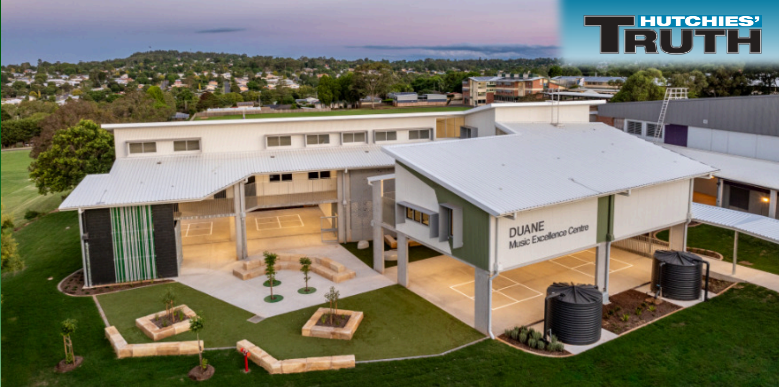
Centenary Heights State High School's new music and drama building and adjacent science lab.