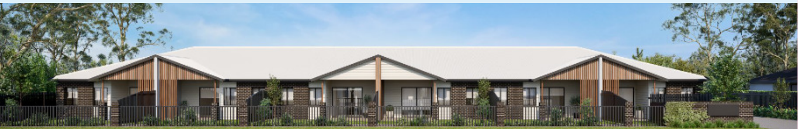
ABOVE: Rockhampton's CBD is the site of 12 new two-bedroom units for NDIS.