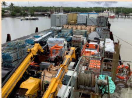
Building equipment and supplies arriving for the new facility.