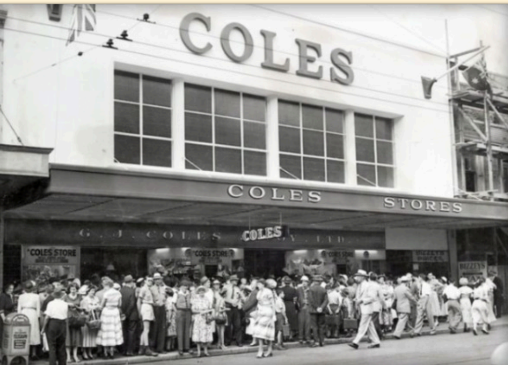
The site of The Fort 70 years ago – opening day Coles store Fortitude Valley Brisbane, February 12, 1954.

The creation of the Special Entertainment Precinct meant the Valley could grow to become a vibrant mixed-use precinct including residents, backpacker and hotel accommodation, nightclubs, live music venues, cafes, restaurants and retail businesses.