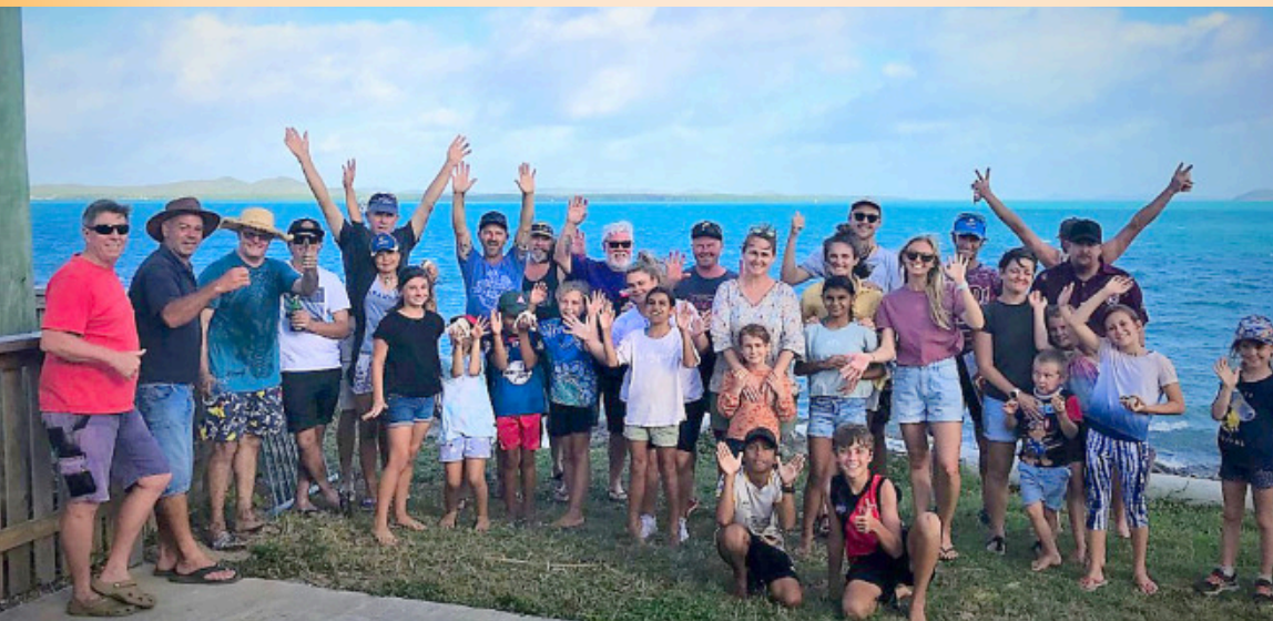
Hutchies' team members and families enjoy the Torres Strait island lifestyle.