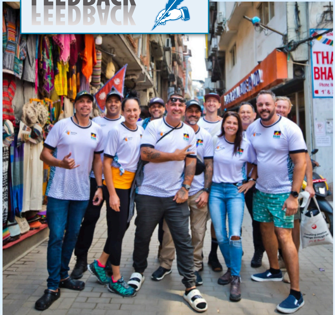
BlakTrekkingers on their fundraising Mount Everest Base Camp adventure for the Black Dog Institute's First Nations Lived Experience Centre.