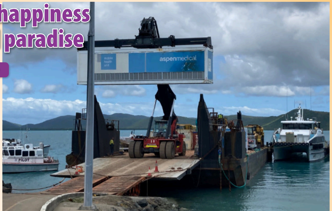
Temporary hospital theatre being barged ashore during the staged redevelopment.

The redeveloped Thursday Island Hospital has 31 inpatient beds, seven emergency department spaces, two negative pressure rooms, operating theatre with four recovery spaces, two birthing suites, five outpatient rooms, and an