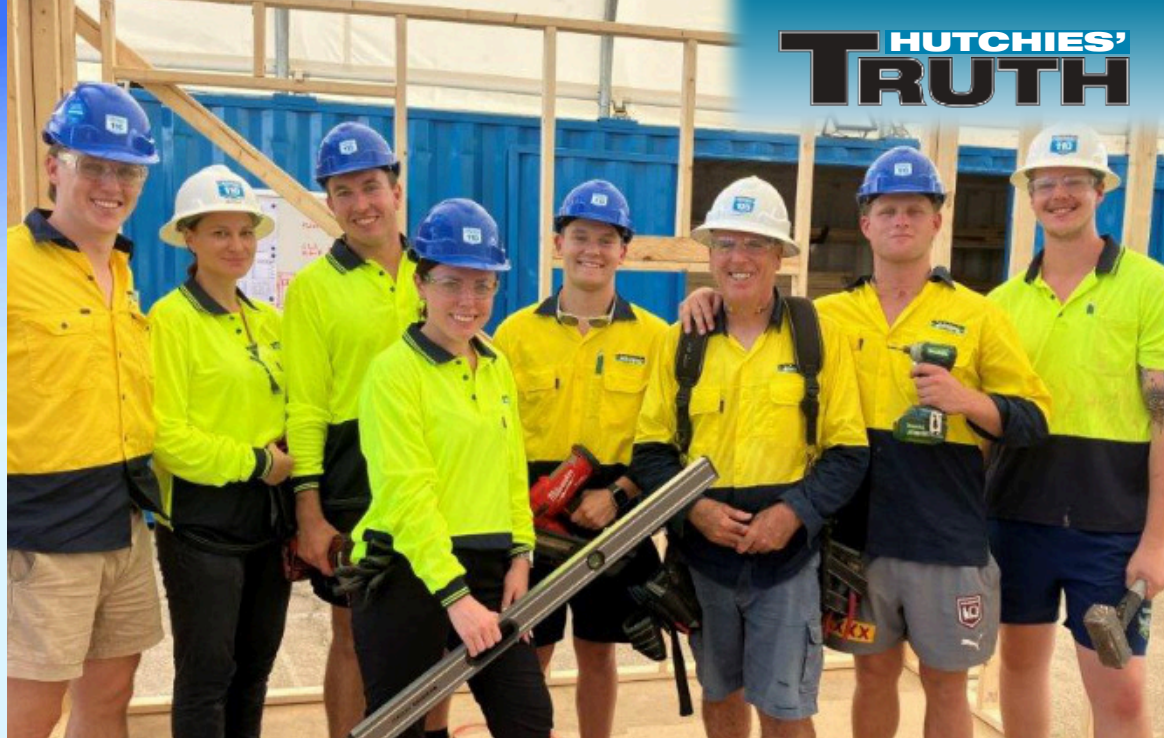
Participants in the most recent Cadet Summer School during a working with tools and framing workshop.

On completion, all suitable cadets can move immediately into a cadetship.