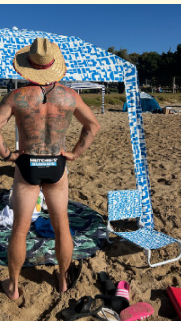
...e most of the vast Hutchies' range on weekend break in Melbourne.