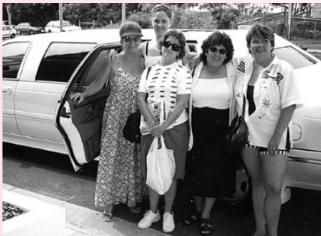
Flashback to 25 years ago ... girls off to Alexandra Headlands on the Sunshine Coast for the inaugural ladies' weekend away.