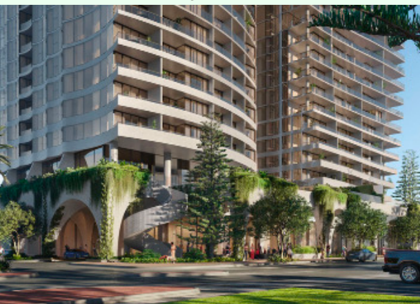
Construction of Vitale Property Group's Mondrian twin-tower project at Burleigh Heads, Gold Coast is back on track.

CONSTRUCTION is back on schedule for the Vitale Property Group's Mondrian twin-tower project at Burleigh Heads, Gold Coast, which was impacted by a catastrophic storm Christmas night.