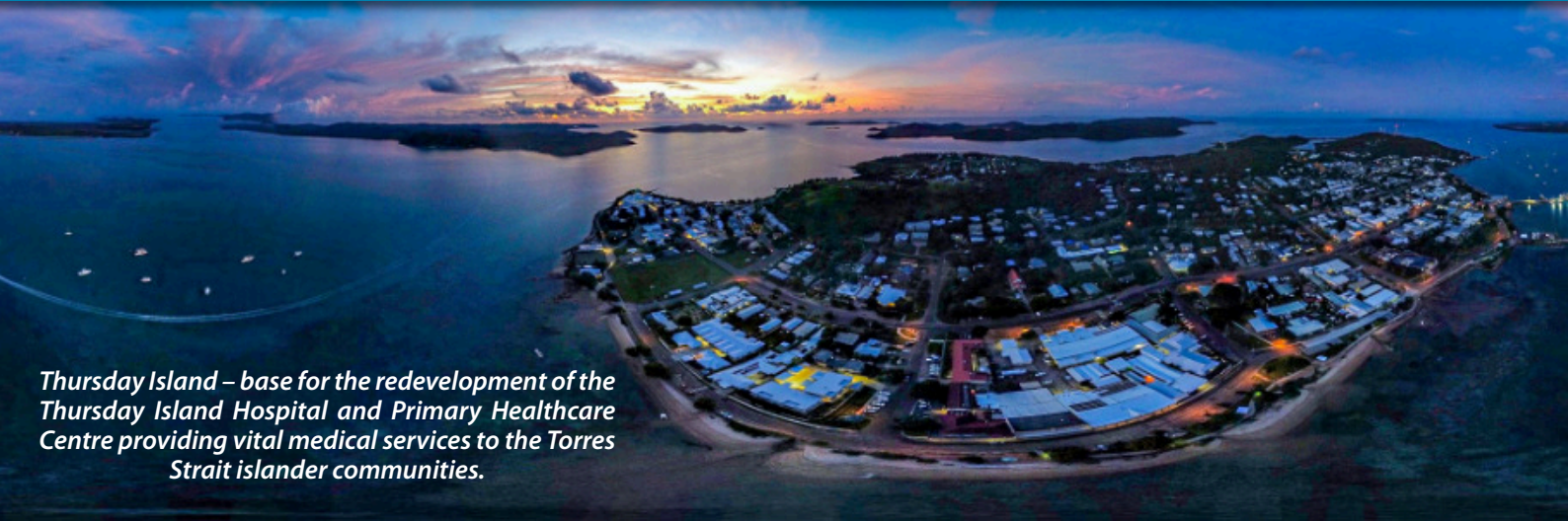
Thursday Island – base for the redevelopment of the Thursday Island Hospital and Primary Healthcare Centre providing vital medical services to the Torres Strait islander communities.